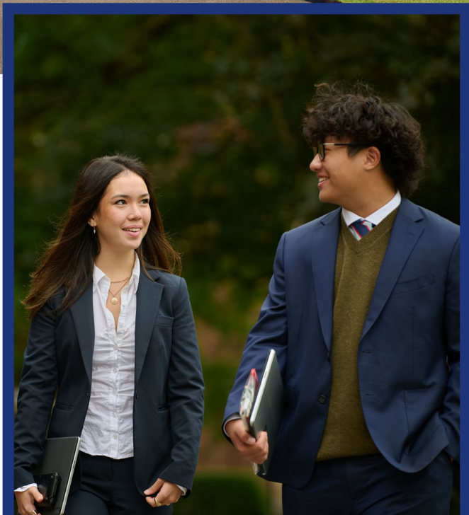
Life at The Leys

The Leys is a co-educational boarding and day school for pupils aged between 11 and 18. Set in the heart of the beautiful and stimulating city of Cambridge, one of the world's leading cultural and academic centres, The Leys' unique location allows pupils unrivalled access to the vast array of cultural and educational opportunities that Cambridge has to offer.