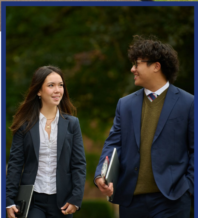
Life at The Leys

The Leys is a co-educational boarding and day school for pupils aged between 11 and 18. Set in the heart of the beautiful and stimulating city of Cambridge, one of the world's leading cultural and academic centres, The Leys' unique location allows pupils unrivalled access to the vast array of cultural and educational opportunities that Cambridge has to offer.